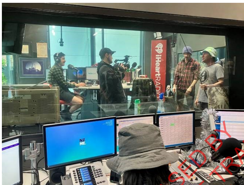
Radio Hauraki 'The Big Show' hosts preparing social media video for the Kia Mataara safer boating campaign

As part of Maritime NZ's Kia Mataara safer boating campaign, we are teaming up with Radio Hauraki to use an entertaining radio "adventure" aimed at reducing harm and promoting responsible behaviour on the water. Radio Hauraki has a fun, authentic style and strong connection to Kia Mataara's core audience, men aged 40+.