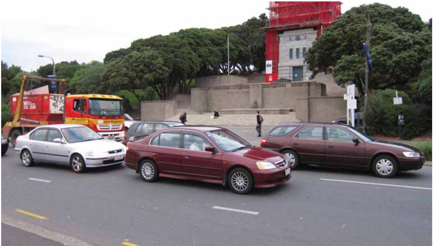
Photo B of the Current National War Memorial Park